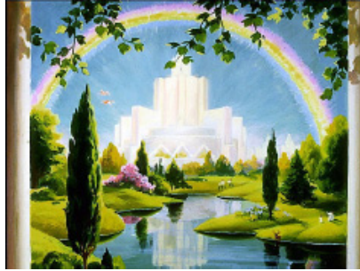
The Third Heaven - where God dwells

And if I go and prepare a place for you, I will come back and take you to be with me that you also may be where I am.