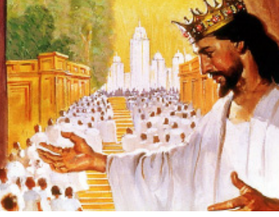
We shall see His face.

One of the greatest joys of the Christian who has lived for Christ in this life will be to see the face of the One who he/she has laboured and lived for. To see the face of a loved one after he/she has been