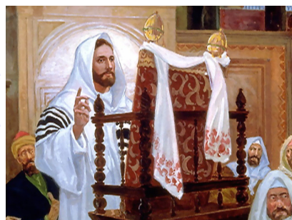
Jesus had total confidence in the scripture

Jesus had confidence in the Scriptures, and here we see Him explaining the truths concerning the promised Messiah. Notice how Jesus di-