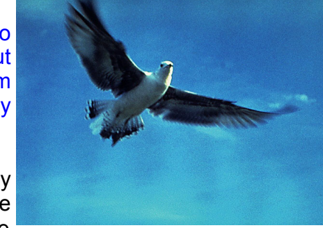
We need the guidance of the Holy Spirit to understand the Bible.

Many today are confused – they don't know what to believe, but we will not be in darkness if we are prepared to do God's will. This is the condition, and if we meet this