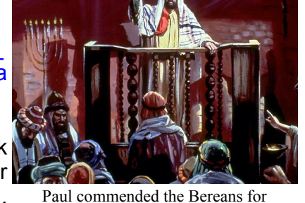
Paul commended the Bereans for searching the Bible every day.

If we are on a bush track on a dark night with no torch, we are in danger of falling and getting lost. The torch, however, shows the way clearly. We are in a world of spiritual darkness,