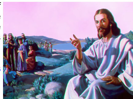
Jesus taught people about a real Devil that is the source of all evil

The reason the Son of God appeared was to destroy the devil's work.