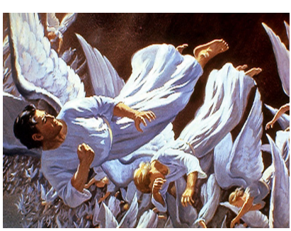
Lucifer and his sympathisers were removed from heaven.

Lucifer was cast out of heaven because of a long succession of selfish choices. He came to live in one narrow dimension: "I". This is how Lucifer, the Archangel, perfect and sinless, debased himself into Satan, the devil. So selfish had he become that he aspired to take God's position of rulership. He wanted God's power, but not His character of love.