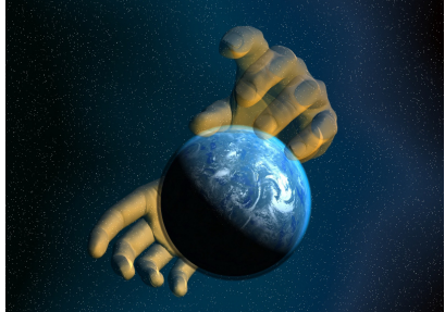
In the beginning God created the heavens and the earth.

Where does the evolutionist begin? Having discarded the Bible record, it is not easy for evolutionists, for they must