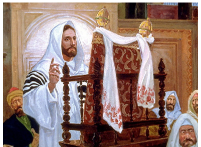
Jesus taught and believed in creation.

Some feel that the carbon-14 method of measuring the age of fossils etc. is most accurate. In some cases this is so, but it has not been reliable in a number of instances. One example of this is when a living mollusc was tested by carbon-14, and found to be dead for 3000 years. "Creation Research Society Journal". Obviously the Carbon-14 method was wrong in this case. It is generally conceded that it takes millions years to pro-