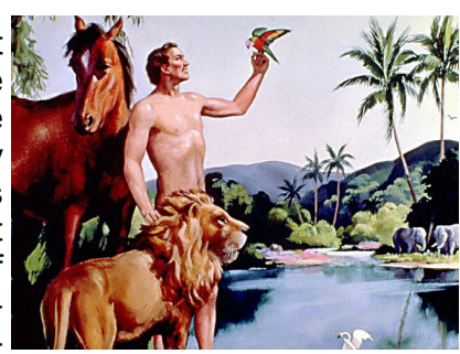
God created the family groups for every creature – you can't crossbreed across groups (eg cross a bird with a dog).

The Bible teaches that the different kinds of plants and animals, reproduce after their own kind. As we examine nature we can see that this is so. By cross breeding, different shapes, sizes and colours can be developed, but they remain the same basic types of plants or animals. Interbreeding is possible between dogs and wolves for example, but they are still in the dog family. Interbreeding is not possible outside family groups. eg. Horse and Cow. A Christian will readily admit that certain changes do take place, caused