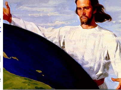
God is all powerful and the source of all life

God is still able to create. He created life in the beginning and today He can make us new if we come to Him. He will give us a clean heart. When we come to the cross of Jesus Christ we will be "born again".