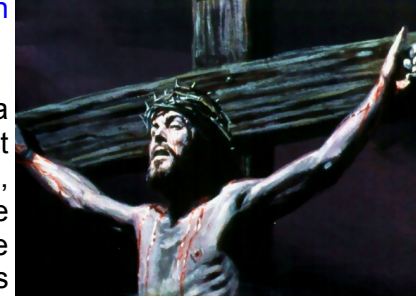
The sacrificial ceremonies were fulfilled at the cross and blotted out.

This written code of ordinances is a rite or a ceremony. In Old Testament times animal sacrifices were made, symbolising the supreme sacrifice Christ or the Messiah would make one day. There were many ceremonies that revolved around these sacrifices, such as partaking of certain foods and drinks. Why don't we offer animal sac-