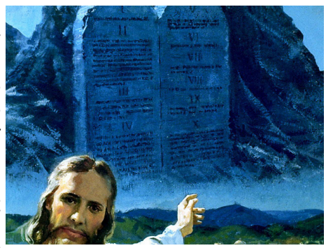
Jesus said – Don't think that I came to destroy the law.

nify that the entire ceremonial system was forever finished. (See Matthew 27:50,51). No longer need the priests offer up sacrifices. The One great and perfect Sacrifice was offered that Friday afternoon, when the true Passover Lamb bowed His head and died. When He cried out, "It is finished", the old Ceremonial Law that pointed the people to His sacrificial death was nailed to the cross. But NOT SO WITH THE TEN COMMANDMENTS. There was nothing