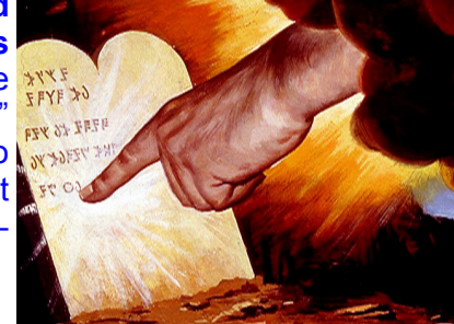
The Ten Commandments were written with God's own finger. The only part of the Bible written directly by God!

whoever keeps the whole law and yet stumbles at just one point is guilty of breaking all of it. For he who said, "Do not commit adultery," also said, "Do not murder." If you do not commit adultery but do commit murder, you have become a law-breaker.