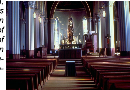
The Roman Church Capitalised on Constantine's Law and pressed it further

"The Bible says, remember that thou keep holy the Sabbath day. The