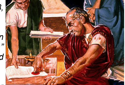
Constantine's Famous Sunday Law of A.D. 321

The festival of Sunday, like all other festivals, was always only a human ordinance, and it was far from the intention of the apostles to establish a divine