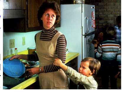
The Sabbath offers us a day with less responsibilities in the kitchen

On the day before the Sabbath; called the preparation, God commanded all baking, and boiling to be done. In other words, the housewife is to rest on the Sabbath, and prepare all food on the preparation day (Friday). She needs the blessing of the Sabbath too, so no