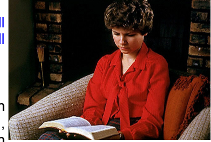
Sabbath offers us the opportunity for more time studying God's Word to learn more about Him

The ploughing and harvesting time can be very busy for farmers, yet God said, even in busy times you must rest on the Sabbath. Many, many farmers can testify how they have lost nothing by keeping God's particular command,