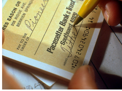
is faithful to us.

God has done so much for us, we can indeed be cheerful in doing what He asks of us. Tithing is not a burden. It is a happy privilege. A partnership with When we are faithful to God – God God.