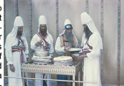
Tithe was used to support the priests attending to the Sanctuary service.

The Levites possessed little or no land, ran no businesses, and did not work for wages. They were the ministers of the people and worked for God in caring for the temple and its services. God regarded this phase of Israel's life as most important, and the Levites were to do this work on a full time basis. Their income was derived from the tithe, given by the other eleven tribes.