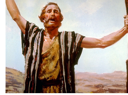
Prophets called people to repentance and gave them messages from God.

pect to see it in the Christian church. Ezekiel 3:17 Son of man, I have for the